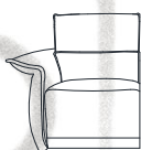
cod. 131-132 RELAX ARMCHAIR RAF/LAF FIT TO 2STR AMXI