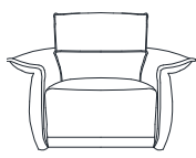
cod. 100 ARMCHAIR