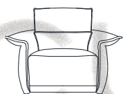
cod. 160 RELAX ARMCHAIR