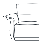
cod. 111-113 ARMCHAIR RAF/LAF FIT TO 2STR MAXI